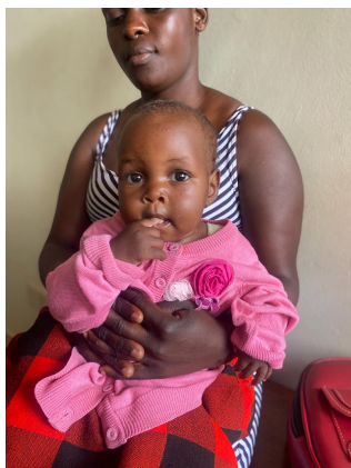
Above, promise at the probation office Before handing her to us.