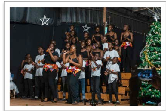
Above, the Christmas musical presented by our children.