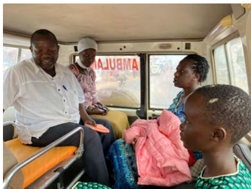
Above, one of the children being brought back as a result of being abused by the guardian