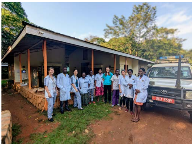
Above, the Health facility team .

Uganda's health care system is still struggling to provide access to basic health care services most especially in the rural areas.