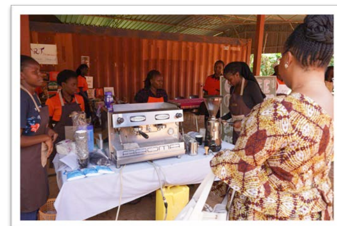
Above, A barista making a cup of coffee for the Minister of youth and children.