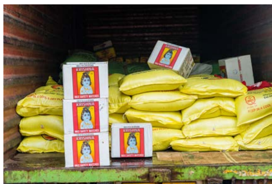
Above, a food donation from one of our partners.