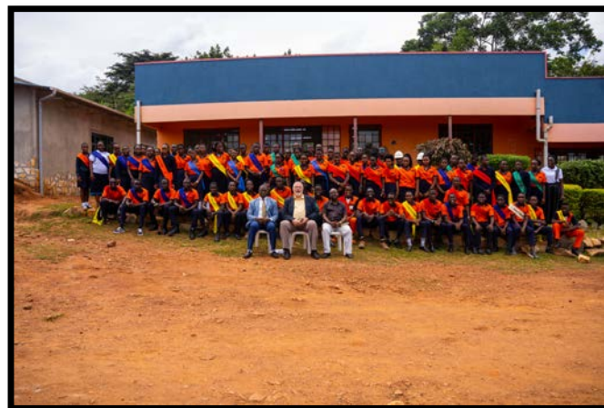
Above, A group photo with all the graduates, guest of honor, founder and local council head.

This year, we were also privileged to host the Minister for Gender, youth and Children, Hon. Sarah Mateke; She was impressed with what our youth are achieving. She encouraged our youth to embrace different skills for a sustainable future.