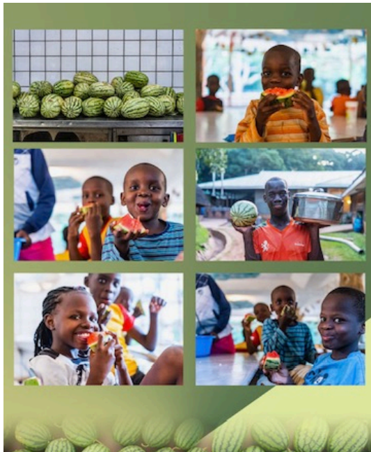
Above, children enjoying fruits from U.Fenil