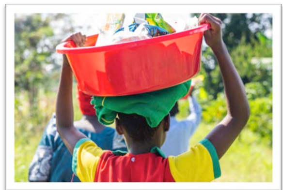
Above, the beneficiaries trekking home with their Baskets .