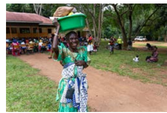
Above, health education to the mothers. Above right, Happy mothers going back home with their baskets.