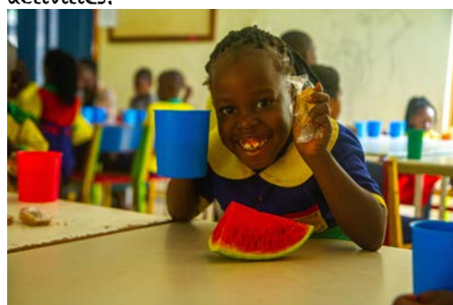
Above, breakfast in the children's home.