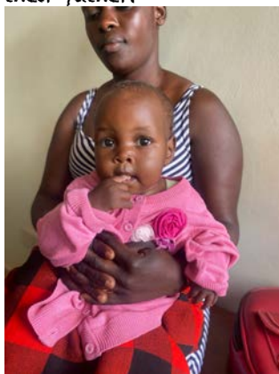
Above, promise at the probation office before handing her to us.