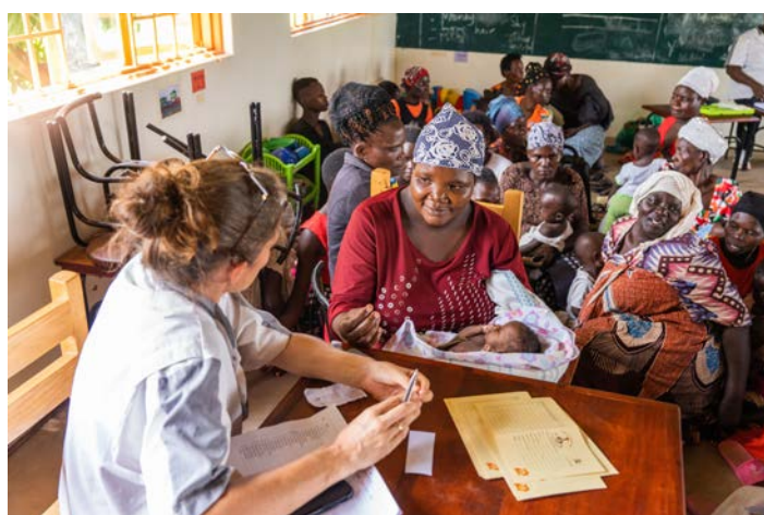
Above, one of our Doctors on one of the out reaches.

581 Upper respiratory infections handled