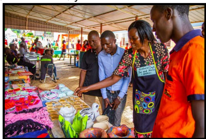
Above, exhibiting some of the products made by our students.