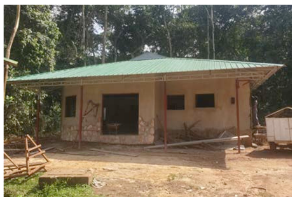
Above, the family unit 12 almost ready for occupancy