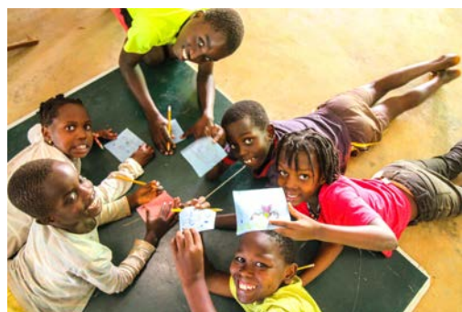
Above, the children in one of the holiday activities.