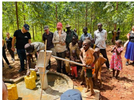
Above, villagers fetching the first water from one of the boreholes.

Quote' "Access to clean air and water is a basic right" Park Wan -soon