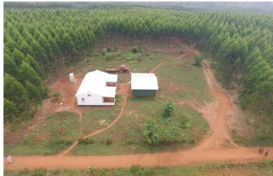
Above, when we had just planted and right, an aerial view of a forest after 3 years already.

In 2021 we started a tree-planting program as a way of extending our influence in the environmental sector and climate change.