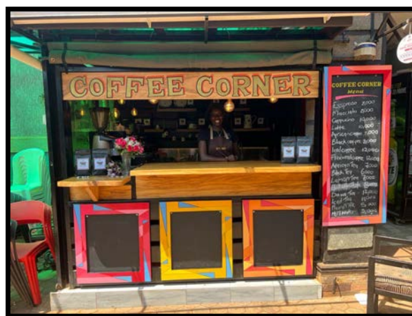
Above, our coffee roaster before installation. Right, our coffee shop