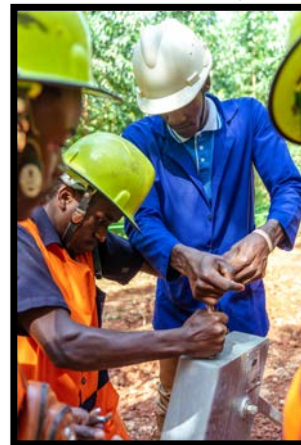
Above, the instructor in blue demonstrating Installation of a hand water pump