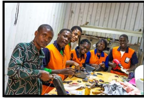
Above, the shoe making class.

As an organization, we have benefited from missionaries, volunteers and visitors who come from out of Uganda with unique skills. This has helped to polish both the instructors and our students.