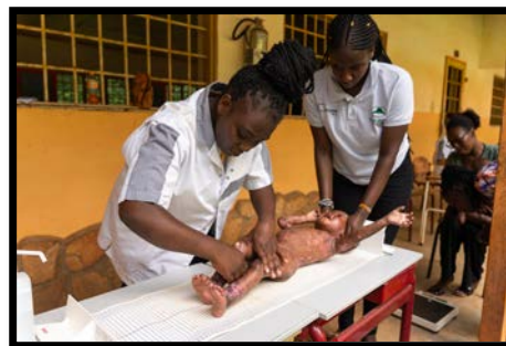
Above, the beneficiaries of the malnutrition Program Watching the Christmas musical with mama. Above right, screening of a malnourished child.