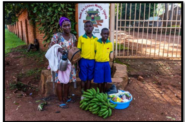
Above, the beneficiaries trekking home with their baskets