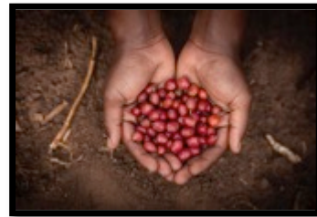
Above, picked red cherries from our coffee garden and below, our smaller roasted beans packages.