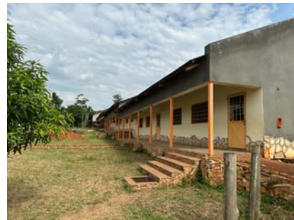
Above, kalagala community school above.