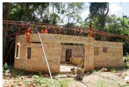
Above, the building and construction class on one of the undergoing projects.