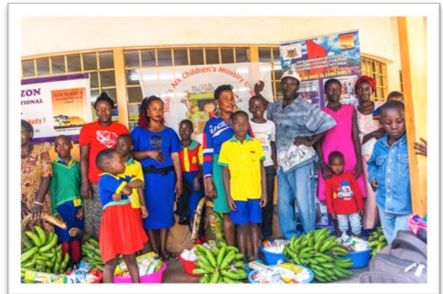
Above, school sponsored children with their parents after receiving their baskets.

"This is good service delivery, things like these are hardly mentioned".