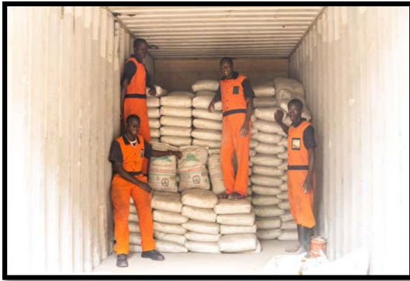
Above, our vocation students in the construction department getting ready to help in off loading cement donated by Tororo cement factory.

Noah's Ark Children's Ministry Uganda has always believed in working collaboratively. Here, throughout the year, we have continued to seek partnerships in all our programs because we believe that we cannot work as a single entity.