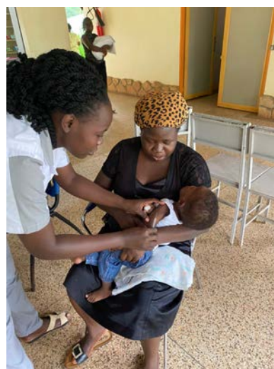
Above, a midwife vaccinating a child at our facility.