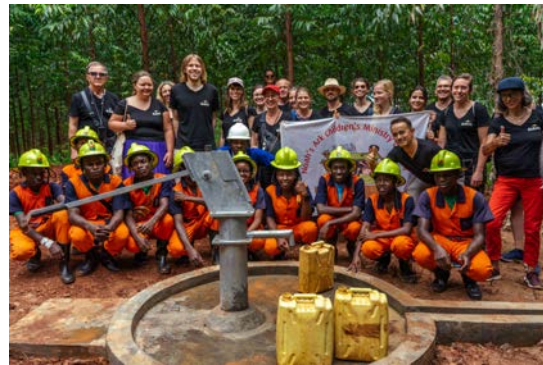
Above, our sponsors as well as our secondary vocation students who were part of the drilling process.

We were happy to officially open the boreholes with our main sponsor.