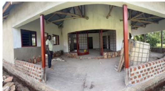
Above, the health facility at kalagala community school