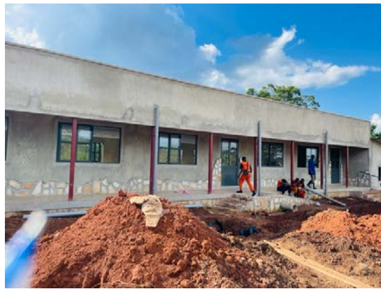
Above, an examination hall donated by one of our partners

Another family unit is nearing completion because of you our partners.