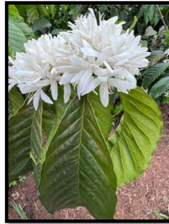
Above, our nicely flowered coffee.

We hope in the future to open a chain of coffee shops to increase youth participation and empowerment in the coffee industry, which will help to create employment for our youth.