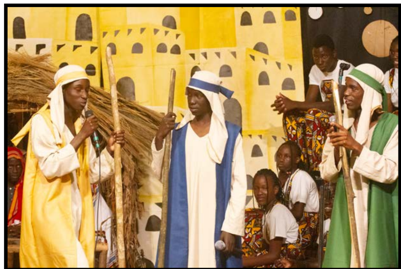
Above, Our children in a Christmas play