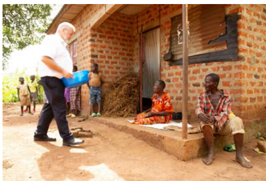
Above, the founder delivering a basket to one of the elderly families and a happy old lady after receiving her basket.