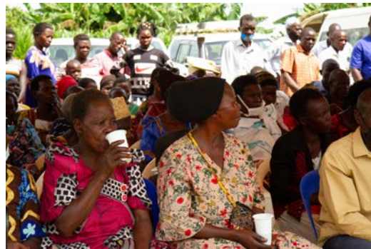
Above, the community testing coffee