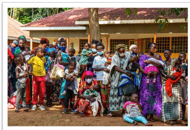
Above, the beneficiaries lining up for their baskets.

We managed to share the joy that Christmas brings to over 600 families. This included the sponsored children, the elderly, the staff, the farmers from kalagala and mutukula villages and the malnutrition program beneficiaries.