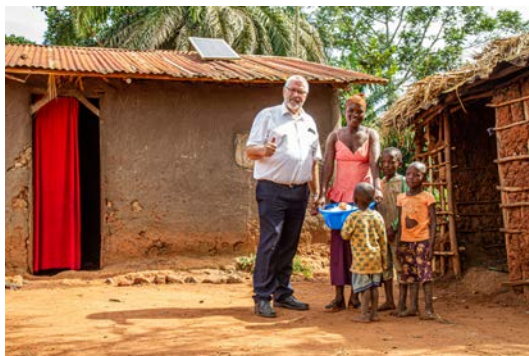
Above, the founder after handing in the baskets as a way of creating rappo.