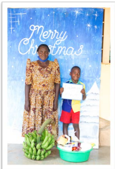
Above, a sponsored parent after receiving their basket with her son.