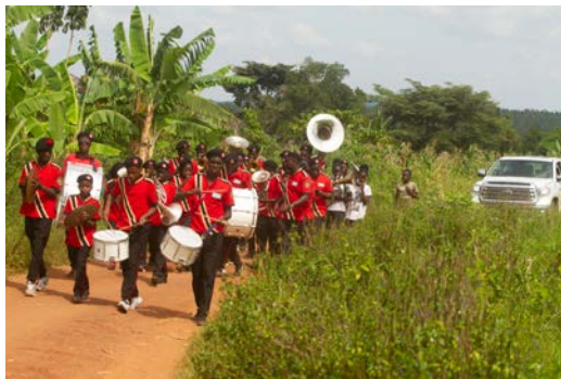
Above, the band doing mobilization.