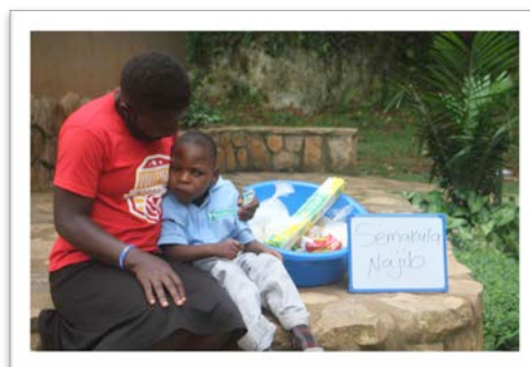
Above, the beneficiaries of the malnutrition program with their baskets